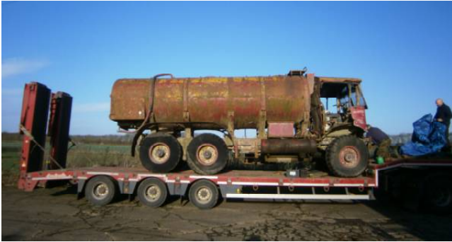
(AEC Matador 6x6 0854 Airfield Refueler)

Now that the Volunteers Workshop structure is complete, we're hoping to be installing an electrical supply and the internal workbenches and equipment, by early in the Spring. Our thoughts will then turn to our restoration projects themselves. We have two distinct projects: the AEC Matador 6x6 0854 Airfield Refueler, and the Brockhurst Bowser Trailer. We're fortunate that several of our new volunteers have specific mechanical, electrical, and carpentry skills, and are extremely keen to get involved. We have copies