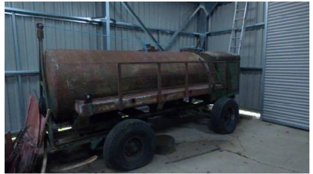
(Brockhurst Bowser Trailer)

of technical drawings of the vehicles, along with a great pool of knowledge from people, who've either worked on AECs, or undertaken their own restoration projects on similar vehicles.